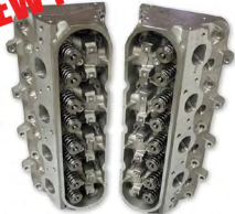
CBM CNC PORTED COMPLETE LS CYLINDER HEADS

LS1, LS3, LS6, LS7, LSX, L92, 241, 243, 823