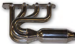
CBM ECOTEC HEADER WITH MUFFLER

LS1, LS3, LS6, LS7, LSX, L92, 241, 243, 823