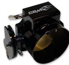
CBM ACCUFAB 95MM LS THROTTLE BODIES